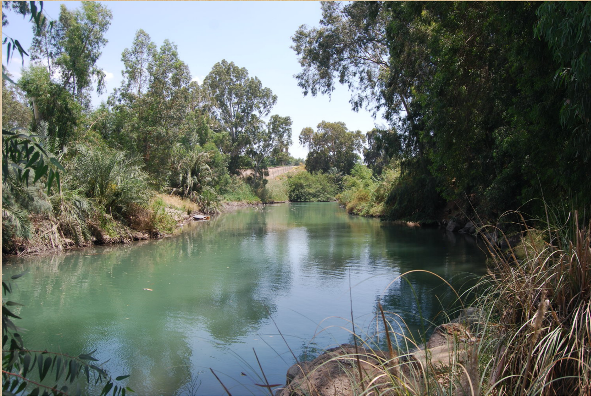
The Jordan River